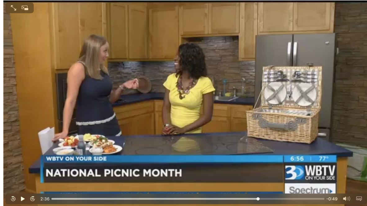
Picnic hacks with My Forking Life blogger

By | August 9, 2018 at 7:24 AM EDT - Updated August 8 at 8:15 PM